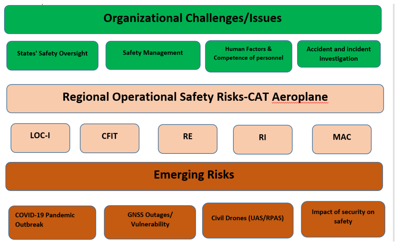
Graph 2: Safety priorities

Therefore, the MID-RASP adopts three focus areas approach: