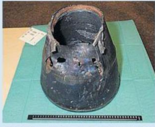
Missile engine nozzle as found in Ukraine.