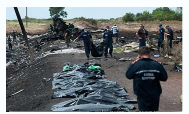
Human remains at crash site