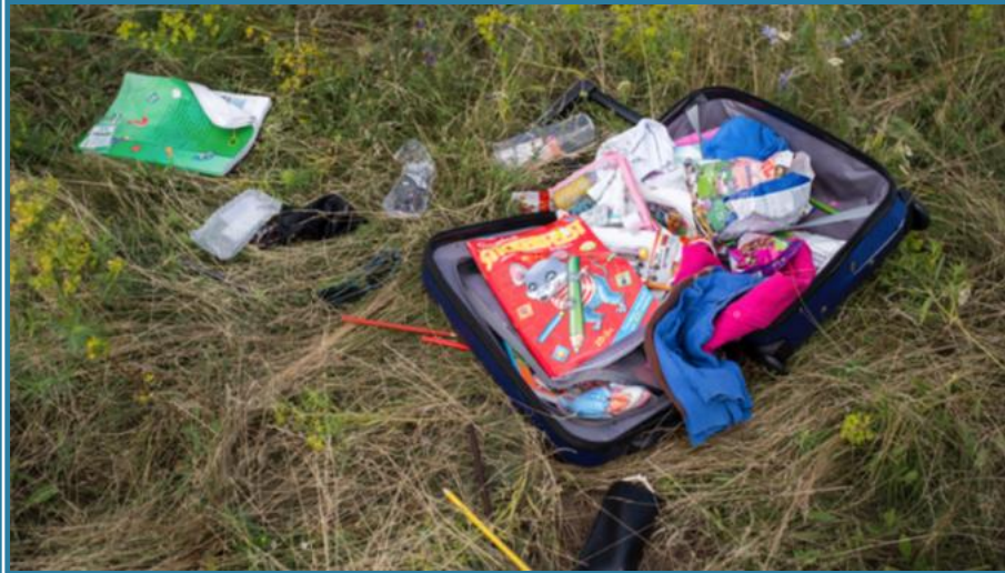
Unassociated personal effects