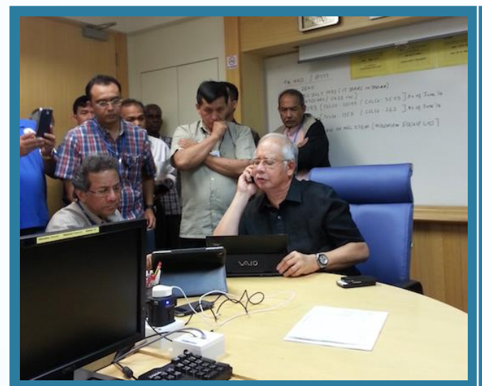
PM at EOC