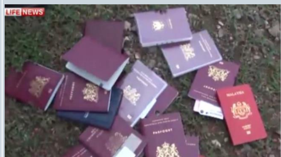
Passports (Associated PE's)