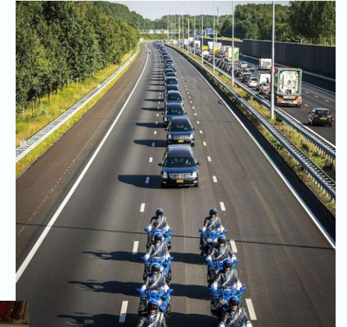
Arrival of first batch with full honour