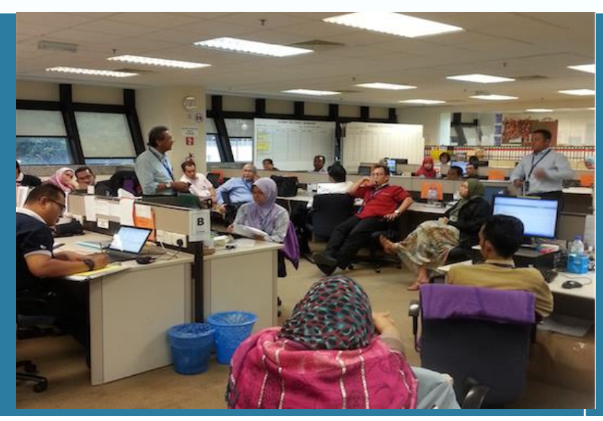
Crisis Director giving latest updates to the ERWG