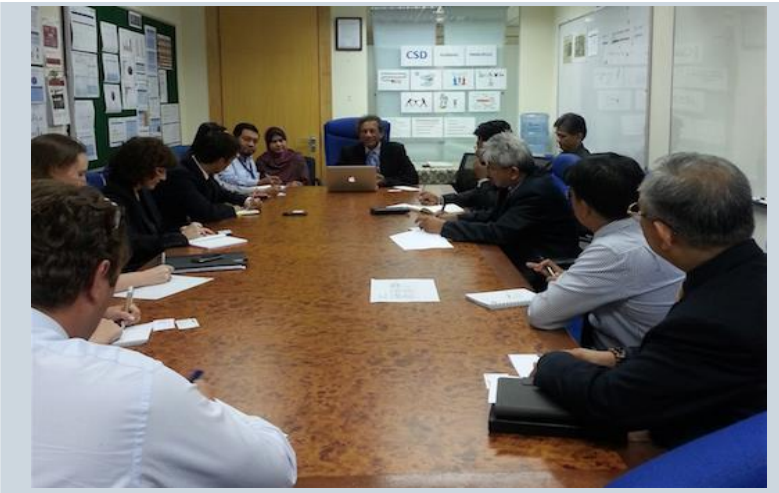
Briefing Foreign Embassies