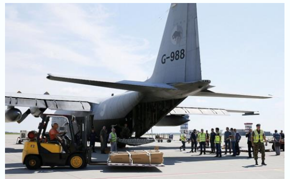
Flown from Ukraine to NL