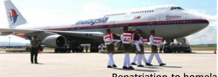
Repatriation to homeland