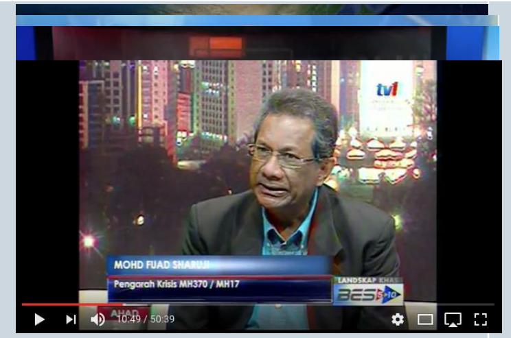
Handling enquiries from local and international media