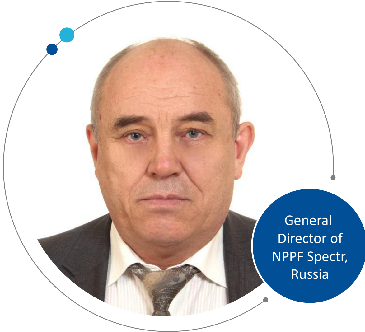
General Director of NPPF Spectr, Russia