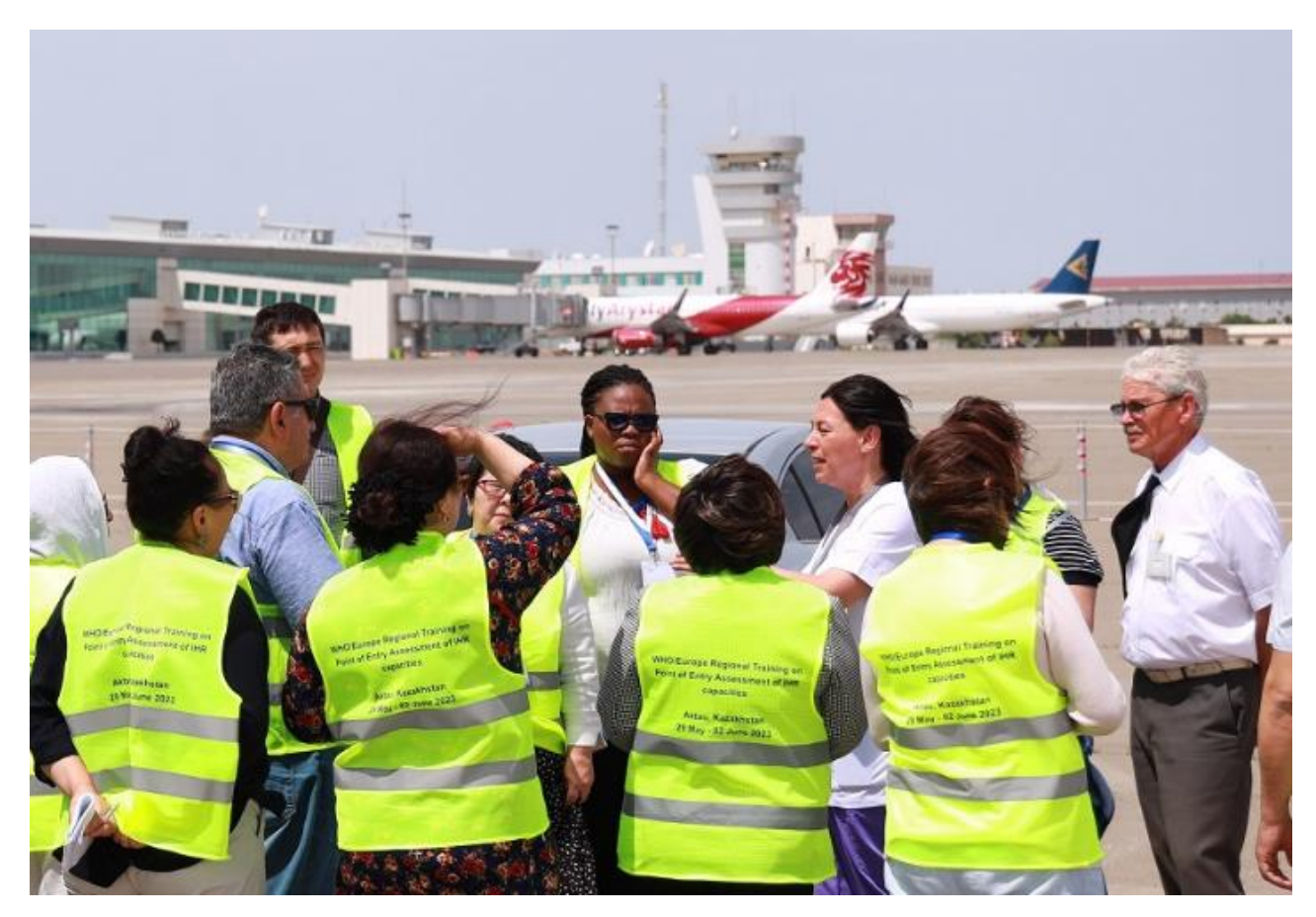
WHO sub-regional POE training, Kazakhstan, 2023