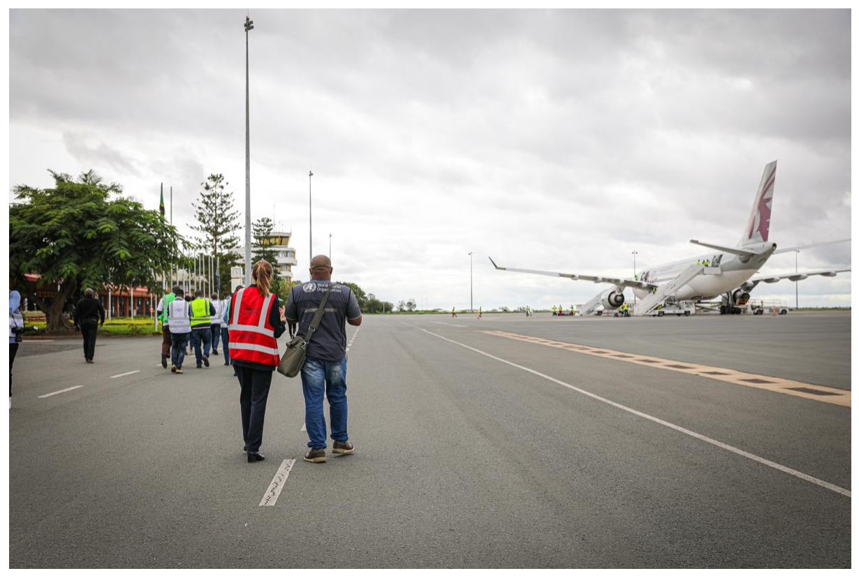
SimEx at Kilimanjaro airport, Tanzania, 2022