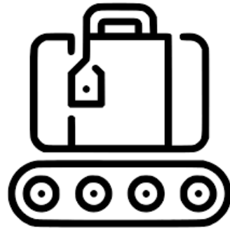
Baggage handling and tracking