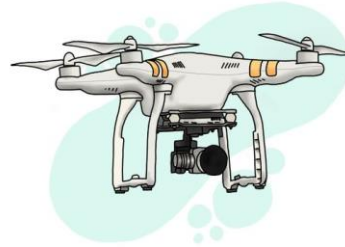
Small drone –

Compliance officer – patrolling assigned areas to ensure civilians are adhering to the law, fosters safety