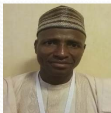
Vice-President Kabir Gusau (Nigeria)