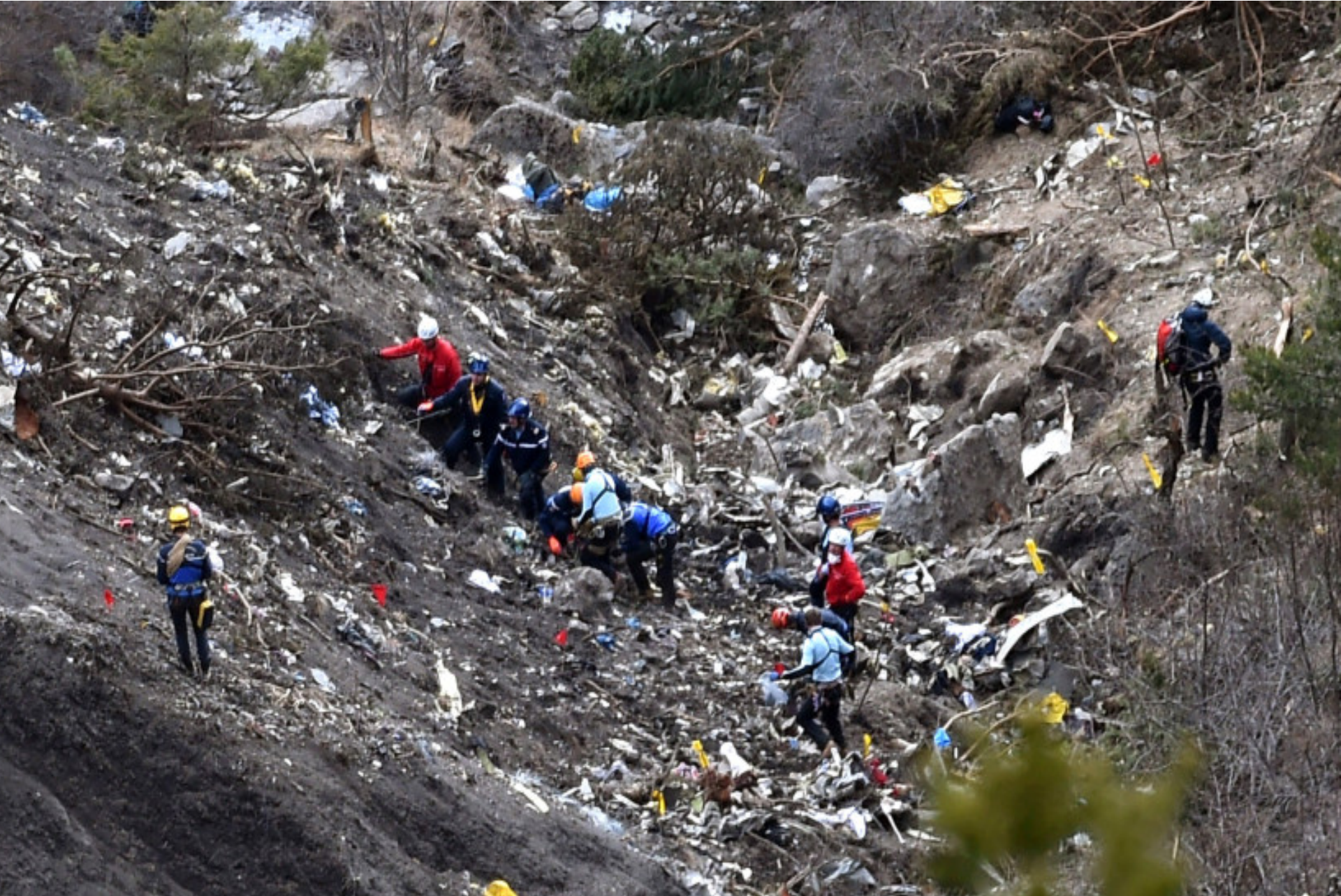
Germanwings 9525 – 24 March 2015