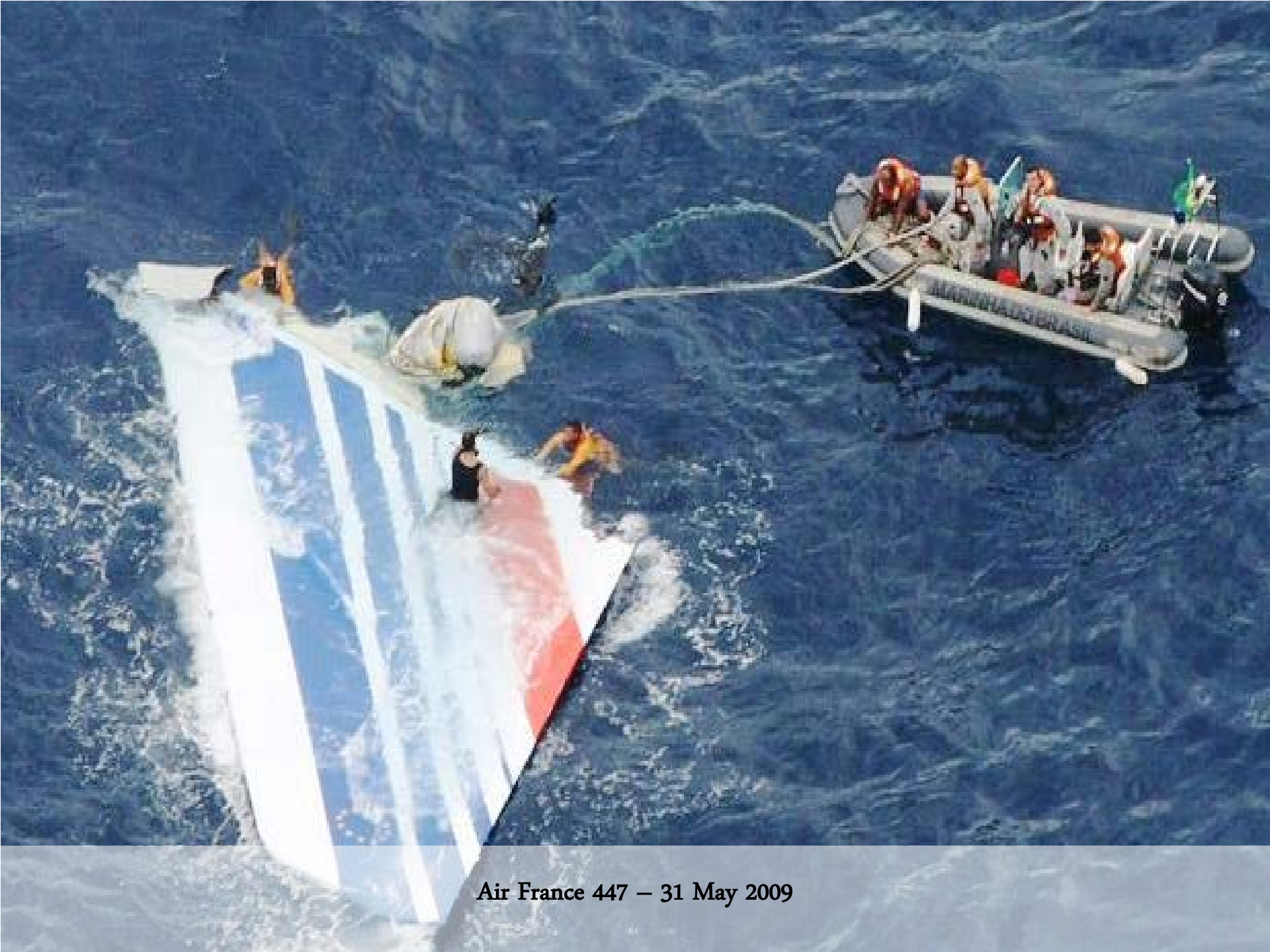
Air France 447 – 31 May 2009