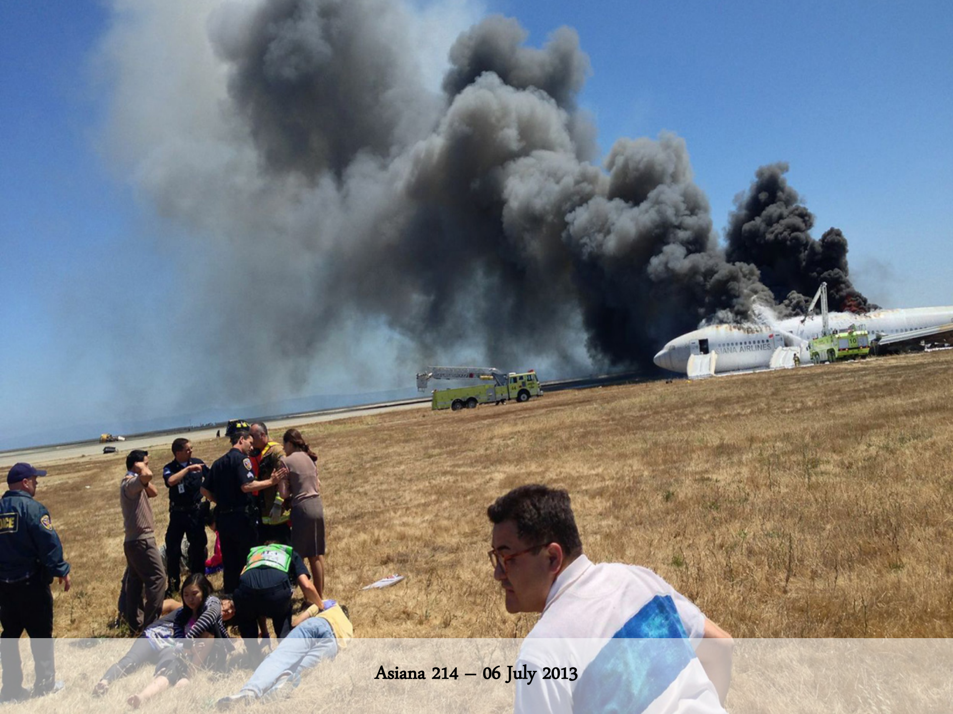
Asiana 214 – 06 July 2013