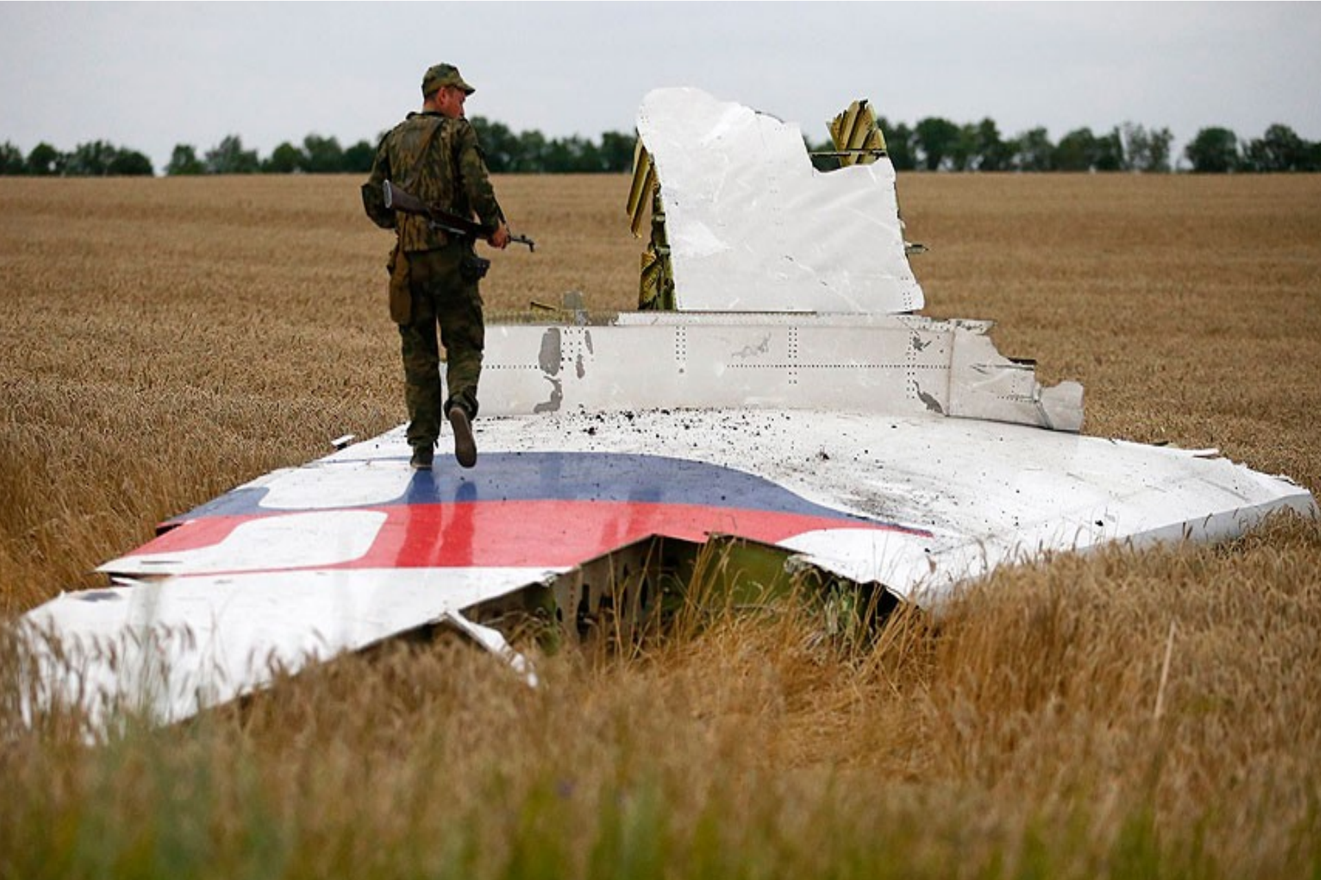
Malaysia Airlines 17 – 17 July 2014