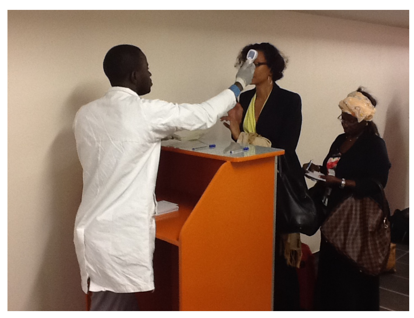
Présentation de la Guinée – 4ème Réunion du CAPSCA-MID; et 5ème Réunion mondiale du CAPSCA GLOBAL/5 - Caire, Egypte