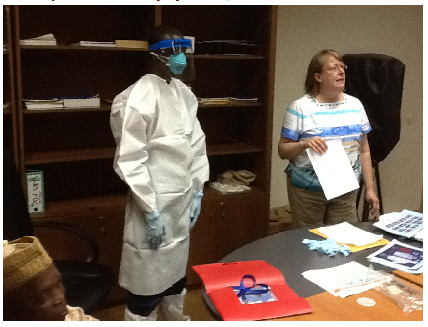
Présentation de la Guinée – 4<sup>ème</sup> Réunion du CAPSCA-MID; et 5<sup>ème</sup> Réunion mondiale du CAPSCA GLOBAL/5 - Caire, Egypte