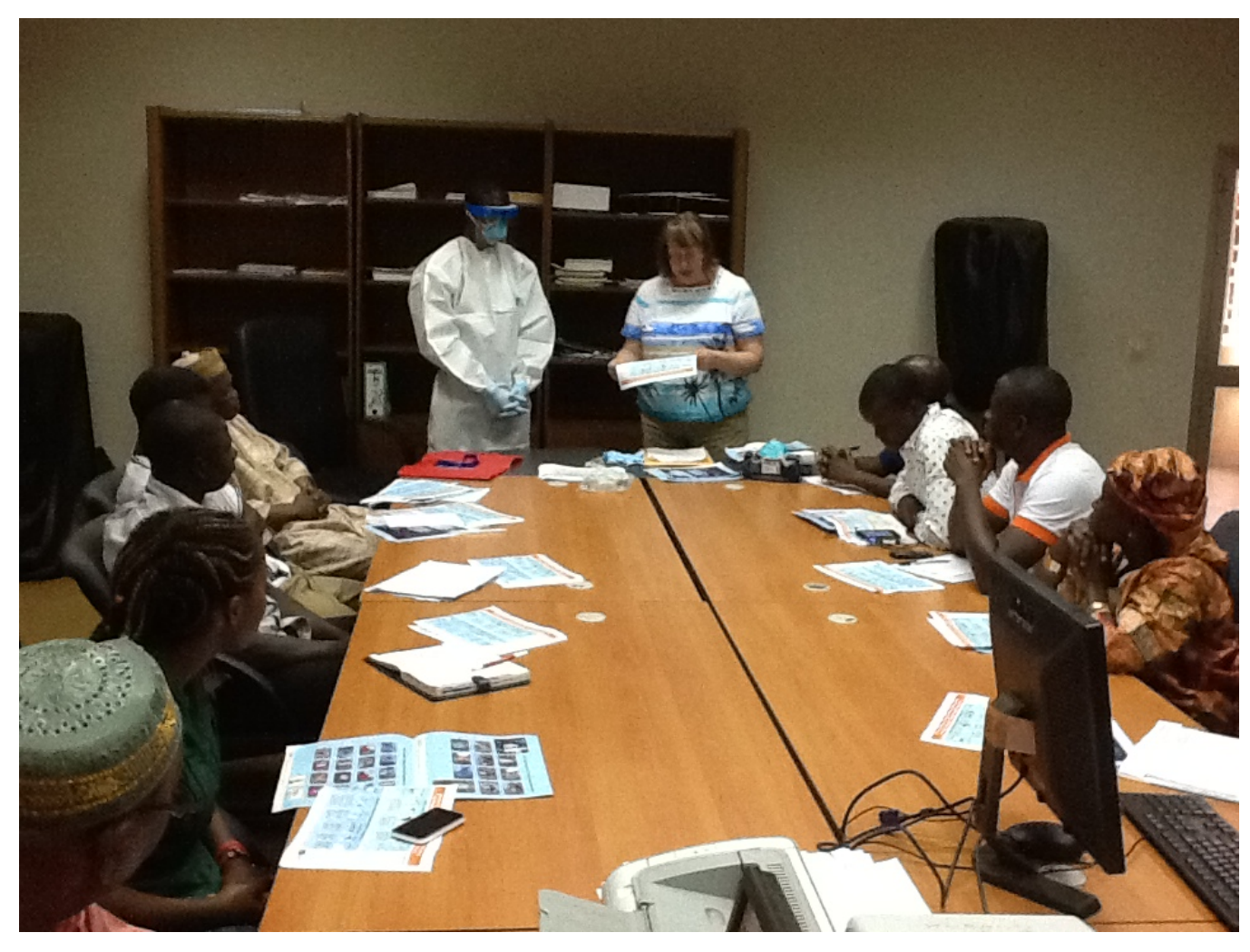
Présentation de la Guinée – 4<sup>ème</sup> Réunion du CAPSCA-MID; et 5<sup>ème</sup> Réunion mondiale du CAPSCA GLOBAL/5 - Caire, Egypte