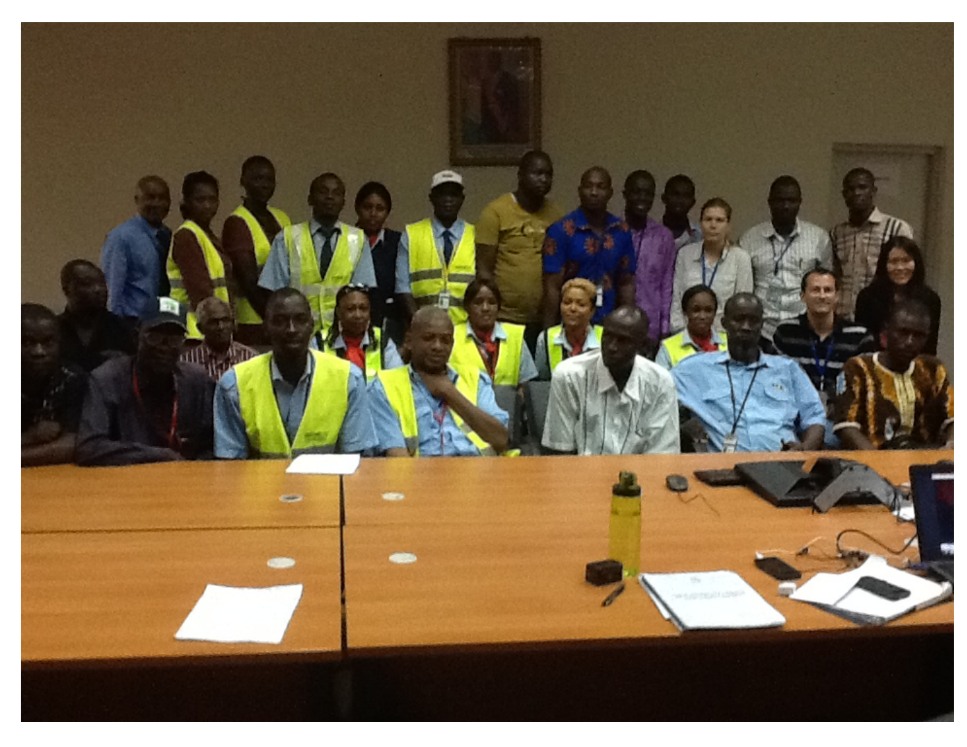
Présentation de la Guinée – 4<sup>ème</sup> Réunion du CAPSCA-MID; et 5<sup>ème</sup> Réunion mondiale du CAPSCA GLOBAL/5 - Caire, Egypte