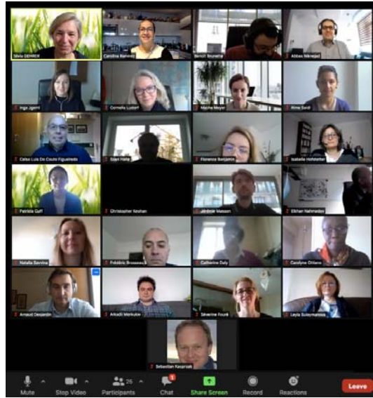
The EUR/NAT Team

The next RD Brief will be issued on 27 January 2021 and the focus will be on ICAO EUR/NAT 2021 Planning.