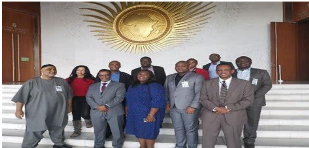
The Head of the Information Society division of the AUC serves as a permanent member and a secretariat of the group.