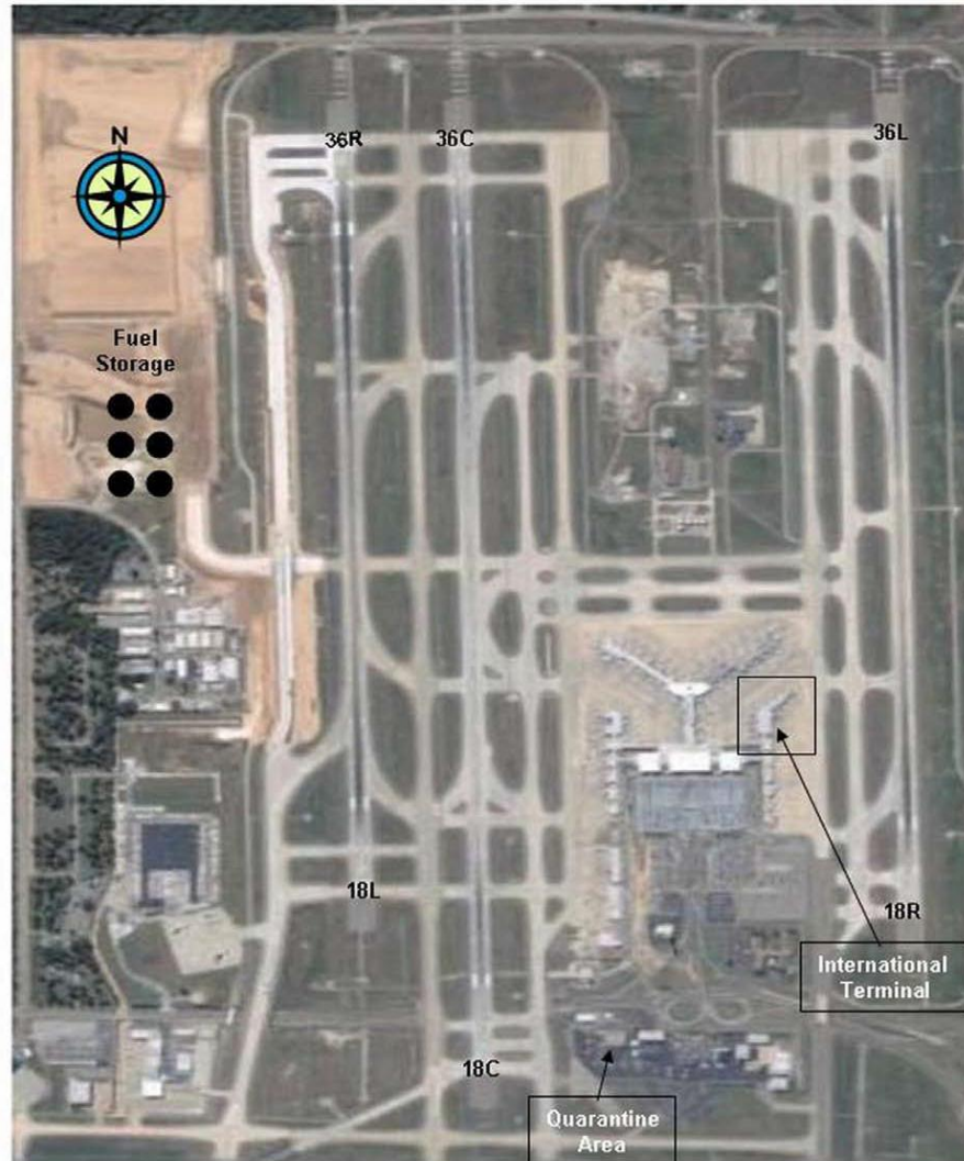
Aerial view of Cape Point International Airport