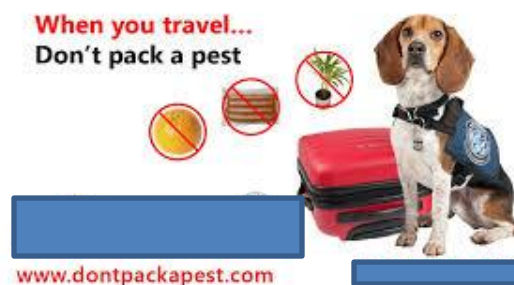
Republic of AnyCountry "Travelers Must Declare" Poster

Angola, Argentina, Benin, Bolivia, Brazil, Burkina Faso, Burundi, Cameroon, Central African Republic, Chad, Colombia, Guinea-Bissau, Congo, Côte d'Ivoire, Democratic Republic of the Congo, Ecuador, Equatorial Guinea, Ethiopia, French Guyana, Gabon, Gambia, Ghana, Guinea, Guyana, Kenya, Liberia, Mali, Mauritania, Niger, Nigeria, Panama, Paraguay, Peru, Rwanda, São Tomé and Príncipe, Senegal, Sierra Leone, Somalia, Sudan, Suriname, Togo, Trinidad and Tobago, Uganda, United Republic of Tanzania, Venezuela, and Zambia.