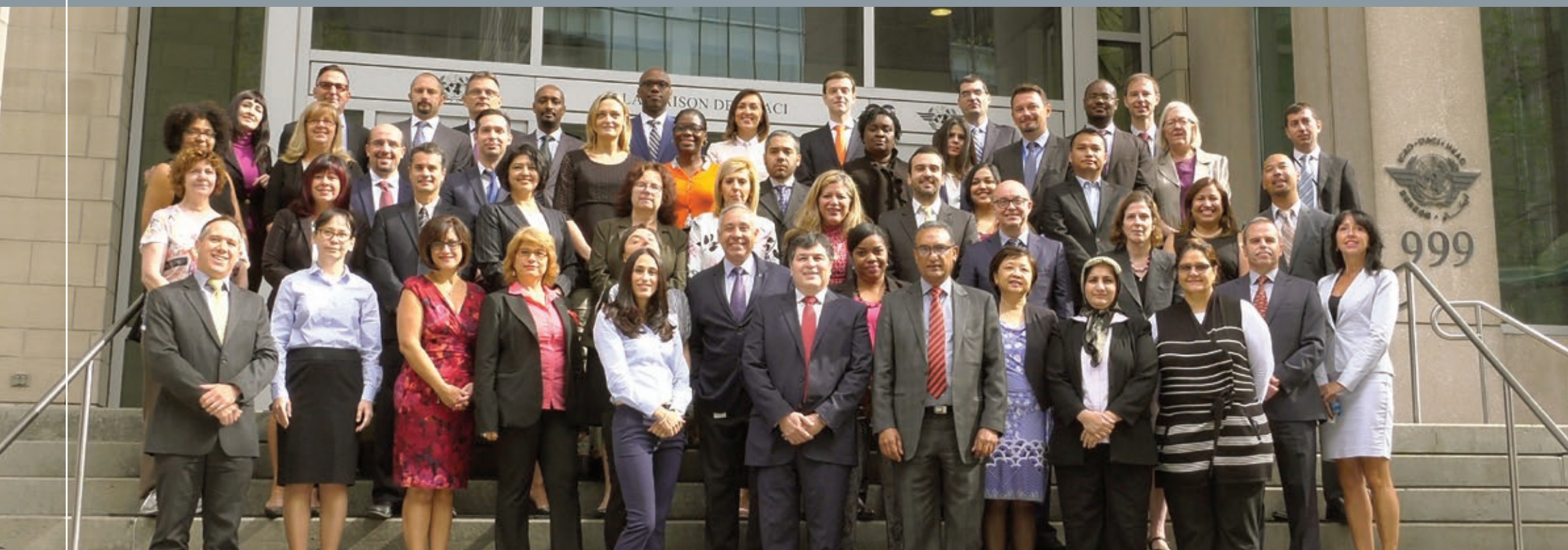
Technical Cooperation Bureau staff

is dedicated to building a safe, secure and efficient global aviation system.