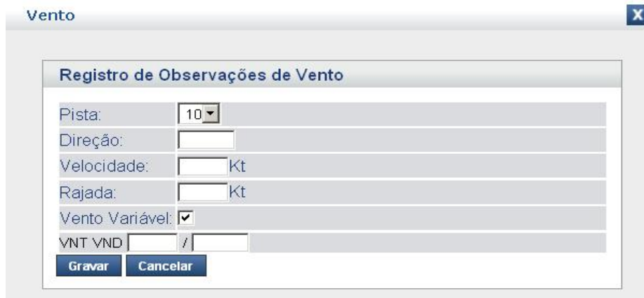
Fig 5 - Record of Wind Observations.