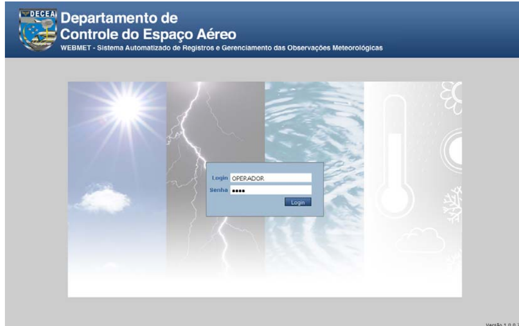
Fig 4 - WEBMET System Access Screen

2.7 Access to the WEBMET System can be done through any Surface and Altitude Weather Station connected to the Internet and with the facilities of an Internet browser, if previously enrolled in the Management Server to access the system.