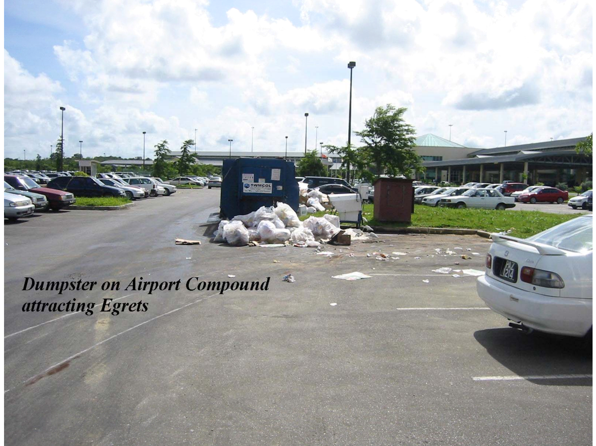
Dumpster on Airport Compound attracting Egrets