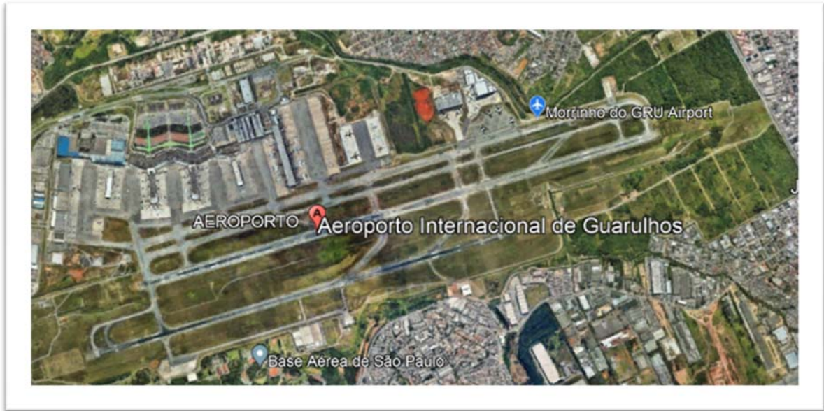
Figure 1 – Guarulhos Airport - SP