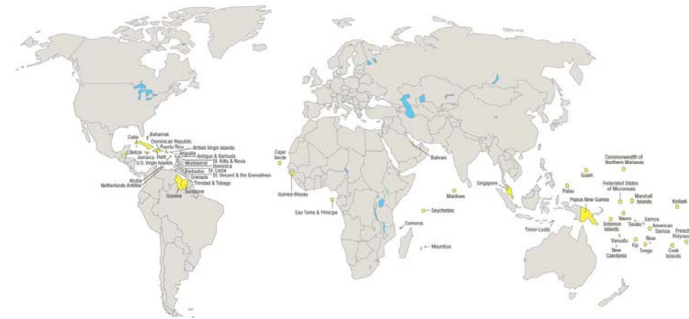
Small Islands Developing States