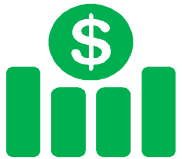
Airport commercial reopening