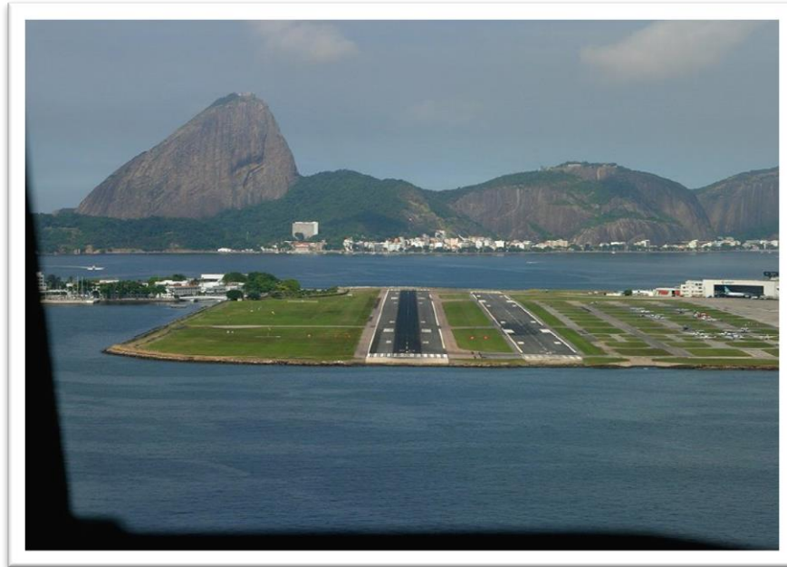
Figure 1 – Santos Dumont Airport

2.3 This project started on July 2018 and the airport chosen to be the first one to receive RNP AR departures was Santos Dumont (SDU) airport, because it's the biggest challenge to overcome, in terms of obstacle, and the one that will bring the most benefits for airlines that operate in this airport.