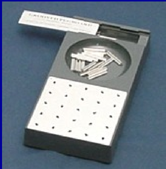
Grooved pegboard test