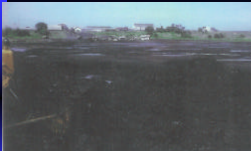
Fig.3- Excavation of Trinidad Lake Asphalt from the "Lake" at La Brea, Trinidad. The raw material is scraped from the surface.

1.7-Today the Lake is situated about 3,600ft from the sea and occupies an area of about 90 acres in a depression immediately to the south of a 140ft high hill, from the summit of which the ground slopes gently northwards to the sea (Fig.4). In appearance the surface of the Lake is a uniform expanse of asphalt which is intersected by areas of water, the extent of which naturally varies according to the season. A not time does the surface become entirely dry and there is always water lying in the folds of the asphalt.