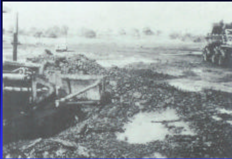
Fig.2- Lake digging equipment

1.6-Details on the findings of Dr Kugler and others concerning the origin of the deposit, the sediments, the depth of the lake (speculations,1925), the depth of the deposit, the various components of the material at different depths, temperature of the Lake, are available to participants.