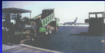
Fig.8 - The 50mm TLA wearing course overlay being laid at Luxembourg runway extension.

The properties of the natural asphalt have remained unchanged since laboratory tests conducted over one hundred years ago to determine the unique characteristics of the lake asphalt.