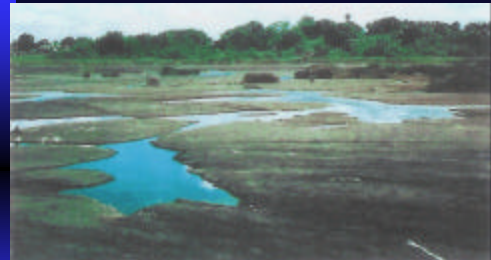
Fig. 1 - The Asphalt "Lake" at La Brea, Trinidad