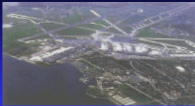
Fig.7 - Kastrup Airport, Copenhagen, on which TLA based surfacings have been specified for runways, taxiways and aprons

TLA binders designs have been used successfully at many large airports worldwide such as: Kastrup in Copenhagen, Varkans Airfield, Finland, JFK in New York, Salt Lake City in the USA, Piarco International in Trinidad, Bremen, Pferdsfeld, Bremgarten Airports in Germany and most recently at the Kai-Tak Airport in Hong Kong etc.