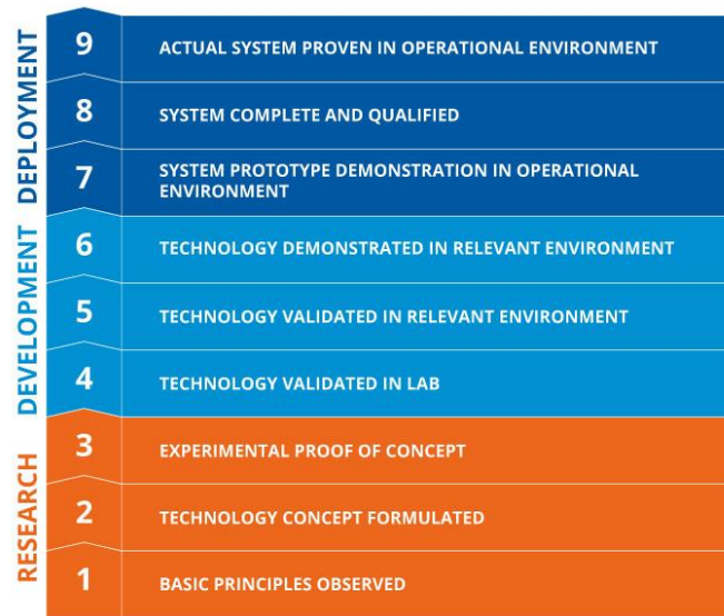
Figure 2: TRL Definition

A generic timeline was drafted in 2016 during initial activities of CCHRAG to support the proposal of deadline for halon replacement in aircraft cargo compartments. This timeline also includes concrete criteria for TRL achievement in the context of the CCHRAG assessment.