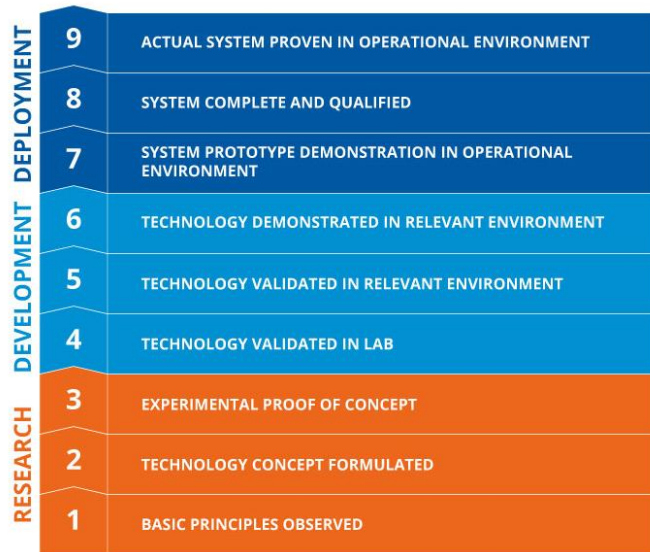
Figure 2: TRL Definition

A generic timeline was drafted in 2016 during initial activities of CCHRAG to support the proposal of deadline for halon replacement in aircraft cargo compartments. This timeline also includes concrete criteria for TRL achievement in the context of the CCHRAG assessment.