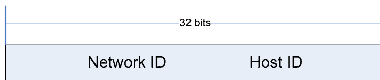
Figure 2-1. IPv4 Address Format

IPv4 Addresses are a fixed length of four octets (32 bits). An address begins with a Network ID, followed by a Host ID as depicted in Figure 2-1.