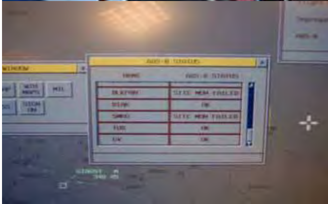
Australian site monitors declared “OK” on operational ATC system in Makassar