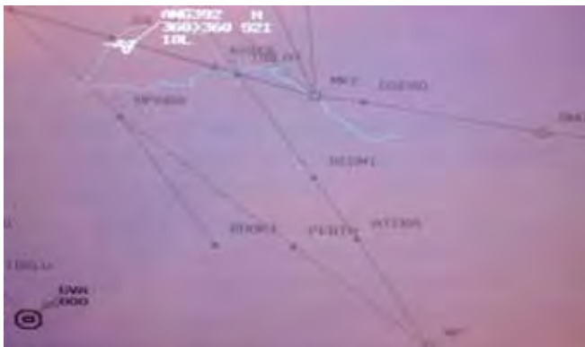
Display ADS-B Data on Operational ATC system in Makassar

5.5 During testing Australia and Indonesia enabled transmission of ADS-B from additional ADS-B ground stations at Broome, Doongan, Kupang and Kintamani. This corresponds with much of the proposed Phase 1B implementation. The data was successfully processed in each receiving country.