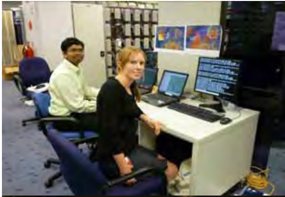
Test environment in Brisbane ATC