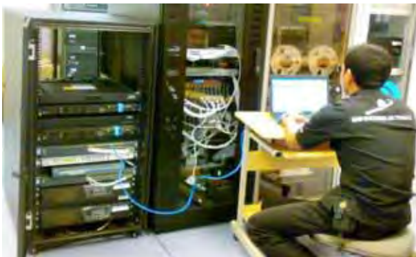
Test environment in Makassar ATC

5.4 Operational ADS-B data from Australia was successfully displayed in Indonesia on the Indonesian RCMS and was displayed on the ATC platform.