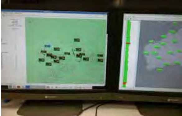
Indonesian data on Brisbane operational RMCS

5.4 Operational ADS-B data from Australia was successfully displayed in Indonesia on the Indonesian RCMS and was displayed on the ATC platform.