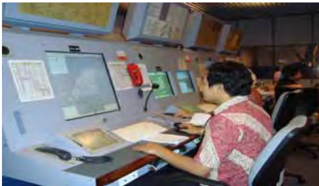
Operational ATC system in Makassar