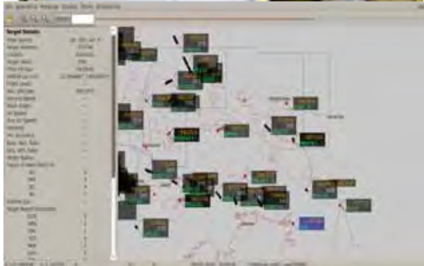
Australian site monitors on Indonesian RCMS