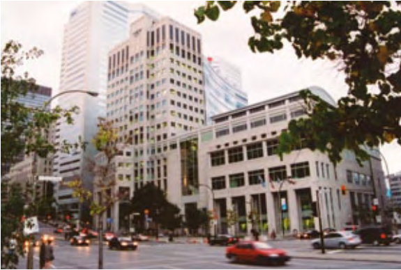
International Civil Aviation Organization 999 University Street, Montréal, Qc., Canada, H3A 2R2 Website: www.icao.int