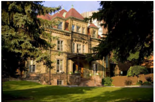
McGill University, Faculty of Law Montréal, Qc, Canada H3A 1W9 Website: www.mcgill.ca/iasl