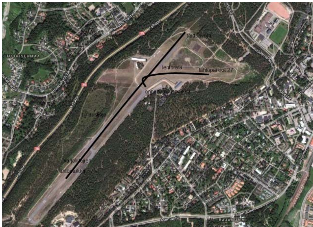
Figure 3. Nummela aerodrome