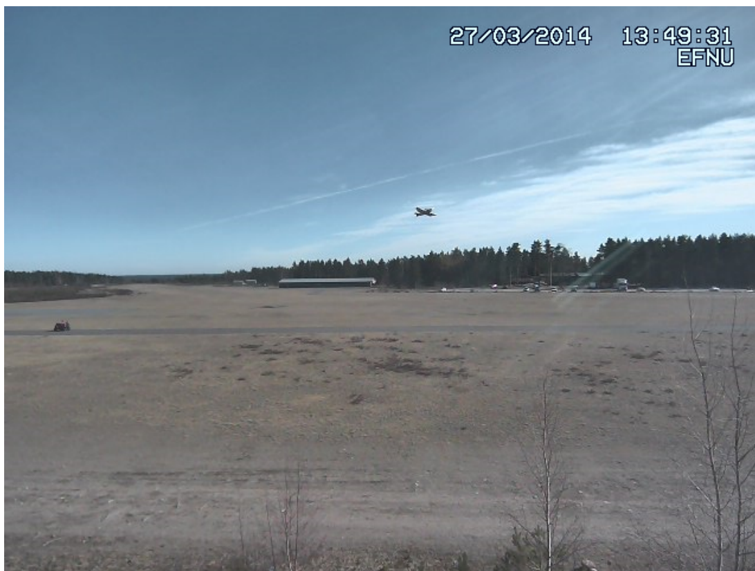
Figure 2. OH-XAC on the accident flight immediately after takeoff at the onset of the turn, only seconds before the accident. The all-terrain vehicle at the left is the ATV used by paragliders. A moment before the photo was taken the ATV crossed the runway.