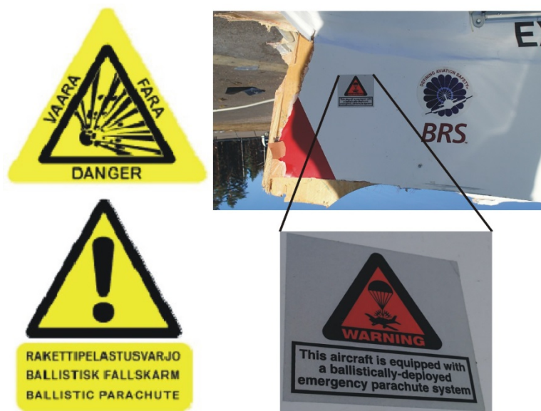
Figure 4. There is a BRS system warning decal, approximately 50 mm wide, on the right side of OH-XAC. On the left side there is a warning decal which complies with directive M3102/06, requiring a 120 mm wide decal. There was no marking on the accident aircraft which indicated the location of the rocket motor assembly. (Photos: SIAF and Finnish Transport Safety Agency).

Although an airworthiness inspection was carried out on the aircraft prior to the commencement of the test flights, the markings that warn of the presence of a pyrotechnical system did not comply with Airworthiness Directive M/3102/06.