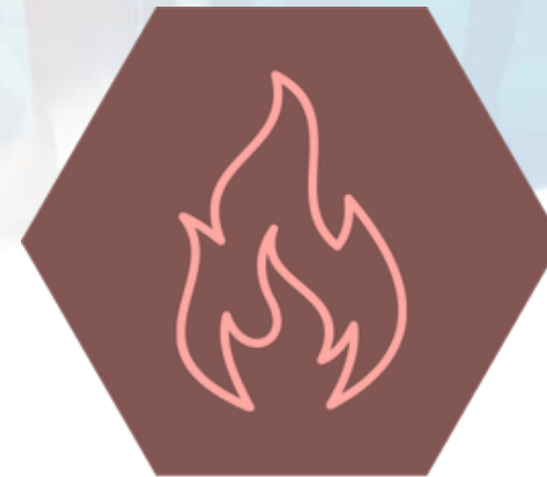
Flying Forest Fire Fighting