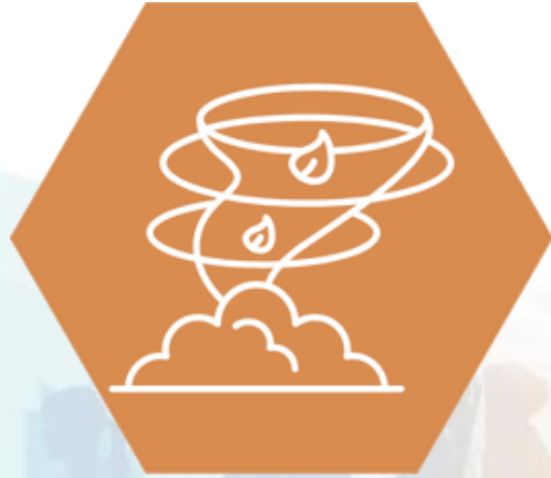
Sand and dust storms