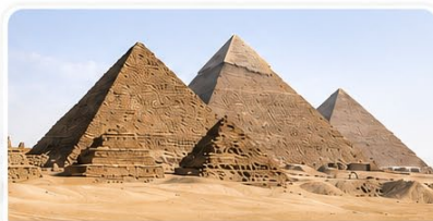
6. The Great Pyramids