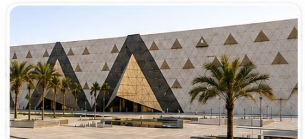
7. The Grand Egyptian Museum