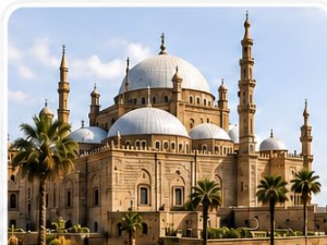
2. Cairo Citadel