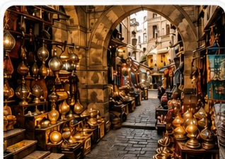
1. Khan El-Khalili