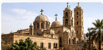
5. Old Cairo