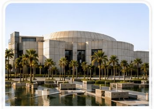
4. The National Museum of Egyptian Civilization