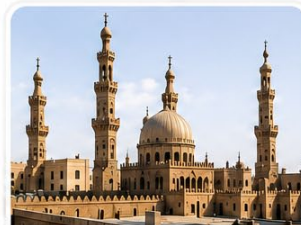
3. Al-Azhar Mosque