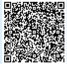
QR code to EUR & NAT Documents

There is no objection to the reproduction of extracts of information contained in this Bulletin if the source is acknowledged.