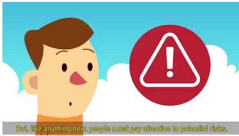
Figure 2: Launch video frame Campaign