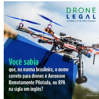
Figure 3: Card Drone Legal

2.4 In February 2016, the Secretariat published the Drone Legal page http://www.aviacao.gov.br/assuntos/drone-legal (Figure 4) which concentrates the information of the regulatory bodies and explains the differences between the ways to use the equipment and its legal requirements, such as recreational and not recreational use, existing rules, etc.