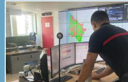
All centers of operations