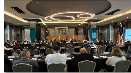
N. Macedonia 2023.