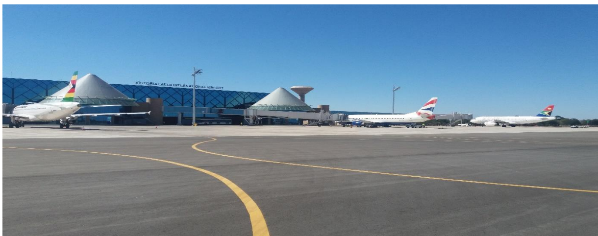
Victoria Falls International Airport Entry into Victoria Falls