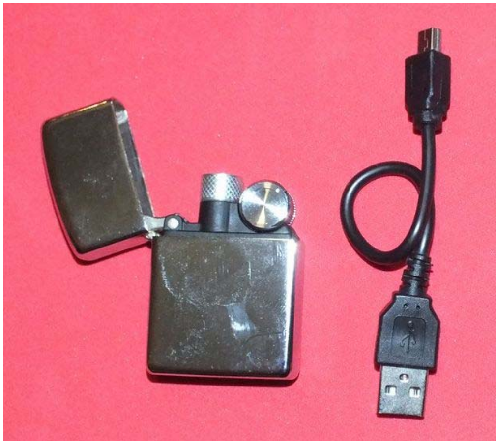
Figure 2 –Example of a small flameless electronic lighter containing a lithium battery designed to be charged via a USB cable.