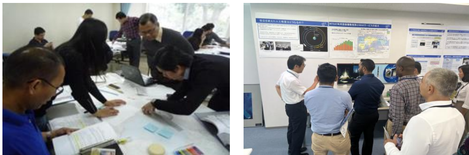
Figure 3. Knowledge Co-Creation Program for PBN Instrument Flight Procedure Design in Japan (left) and for Introduction and management of Air Navigation Services (ANS) technology in Japan (right)

2.1.3 JICA “Knowledge Co-Creation Program” is another scheme of the technical cooperation that JICA carries out training in Japan. This program has received many participants across the world so far and provided ANS-related programs as well such as “PBN Instrument Flight Procedure Design” to acquire enough knowledge and expertise to design air traffic services routes and PBN procedures, which was conducted once a year from 2013 to 2019 with the support of JCAB. Also, a new program titled “Introduction and management of Air Navigation Services (ANS) technology” which is acquired a broad range of knowledge on the Navigation and Surveillance systems has been conducted once a year from 2023 to 2025.