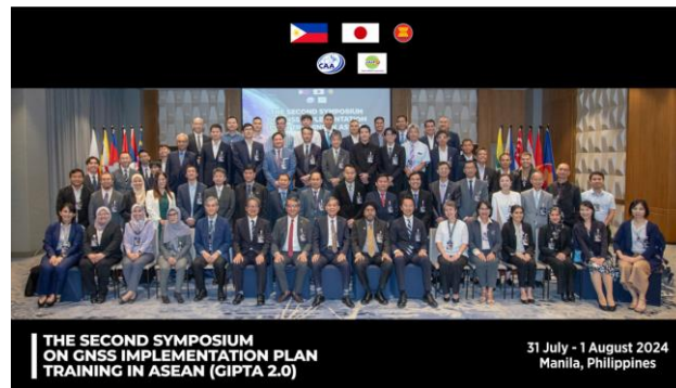
Figure 4. Group photo of GIPTA2.0 symposium

2.2.3 Furthermore, due to the positive reception of this project for ASEAN Member states, GIPTA 2.0 has been launched and planned for three years from 2024. GIPTA2.0 consists of the symposium for ATM personnel in charge of GNSS, Site workshop, Tokyo workshop and training for technical officials of ATM personnel in the ASEAN Member States. The symposium was held at the end of July 2024 in the Philippines. JCAB will continue to support these programs for completed successfully.