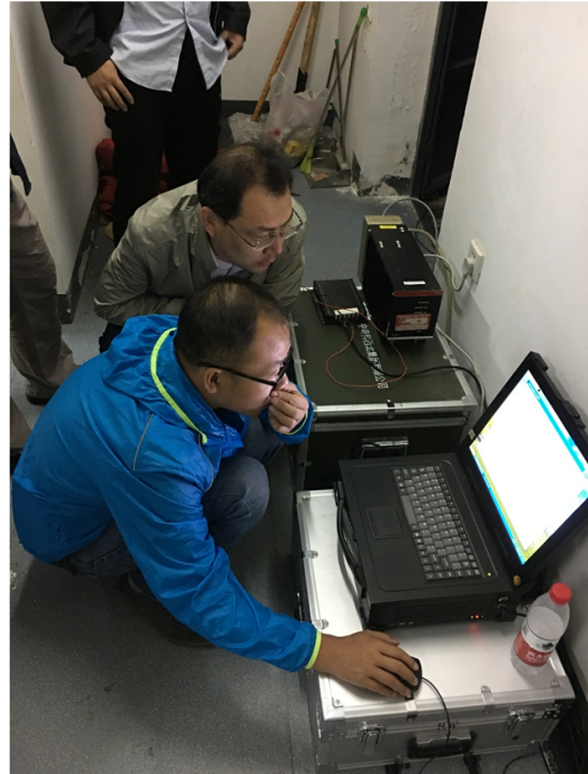
Figure 4 Operational Testing in Tianjin Airport

2.2.4 Flight tests should be conducted no less than twice, once before the operational environment testing period begins and once after the accuracy, availability, continuity and integrity test were completed.