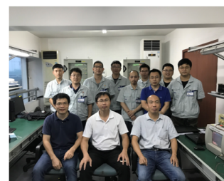
Factory Type Testing in TianJin