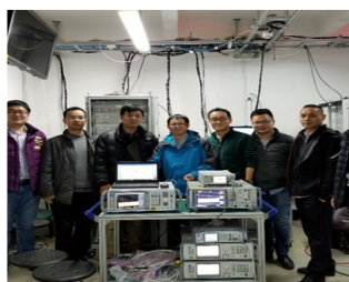
Factory Type Testing in Xian

2.2.2 Factory Type Testing refers to system-level, configuration item-level, and component unit-level tests conducted on the GBAS ground subsystem. It includes the following testing: