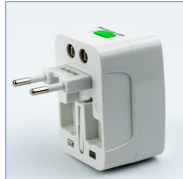
Universal travel adapter / converter plug