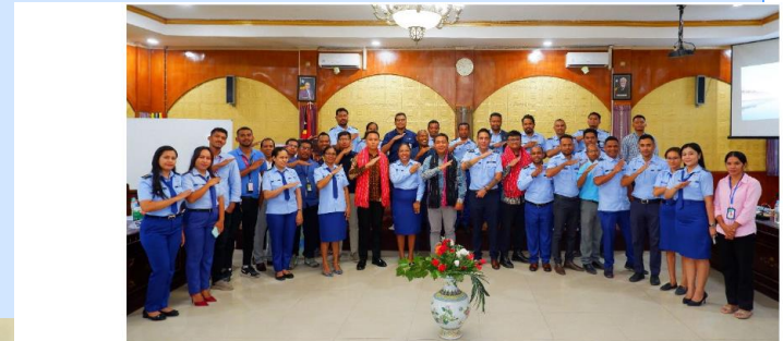
Figure 1. Workshop on the State Action Plan to Reduce CO 2 Emissions from International Aviation, 2-4 September 2025, Dili, Timor-Leste

Support will be continued to enhance safety compliance in the region