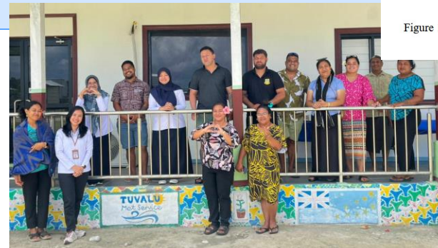
Figure 2. Training on QMS – Meteorological Services, 15-20 Sept 2025, Tuvalu