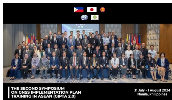
Figure 4. Group photo of GIPTA2.0

2.2.2 GIPTA 2.0 has been planned for three years from 2024. GIPTA2.0 consists of the symposium for ATM personnel in charge of GNSS, Site workshop, Tokyo workshop and training for technical officials of ATM personnel in the ASEAN Member States. The symposium was held at the end of July 2024 in the Philippines. After that the site workshop was held in the Indonesia, Thailand and Vietnam. The Tokyo workshop will be planned at the end of August 2025. JCAB will continue to support these programs for completed successfully.