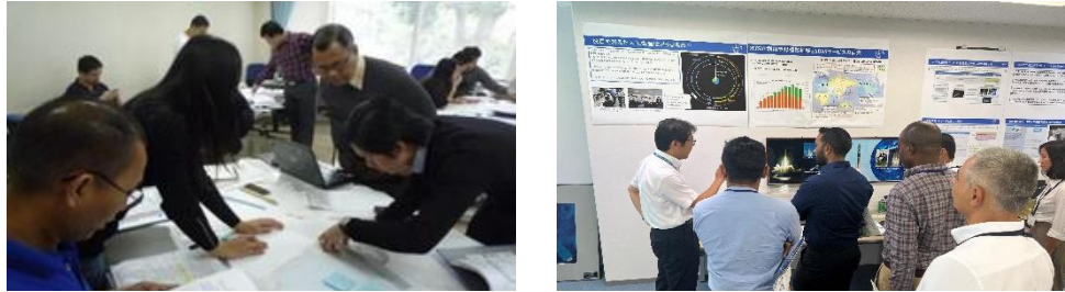
Figure 3. Knowledge Co-Creation Program for PBN Instrument Flight Procedure Design in Japan (left) and for Introduction and management of Air Navigation Services

which is acquired a broad range of knowledge on the Navigation and Surveillance systems has been conducted once a year from 2023 to 2025.