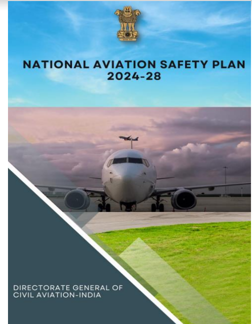
National Aviation Safety Plan (NASP)