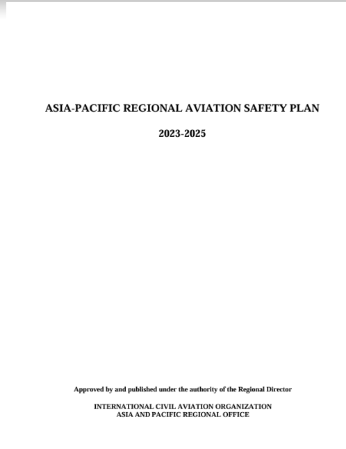
Asia Pacific Regional Aviation Safety Plan (AP-RASP)