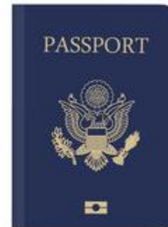
Copy Passport (Photo)