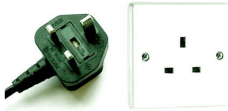
Figure 1 – Common power socket