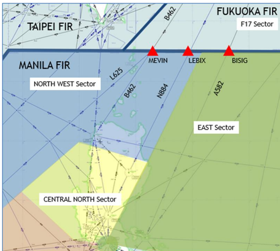
Figure 1: ACC sector structure around FIR interface between Fukuoka and Manila FIRs

2.4 Manila ACC explained the sector structure, traffic flow and ATC equipment (Thales Top-Sky-HE) in Manila ACC as well. Figure 1 shows the ACC sector structure around the FIR boundary between Fukuoka and Manila FIRs, and Table 1 shows the Flight Level Orientation Schemes (FLOS) applied in Manila FIR.