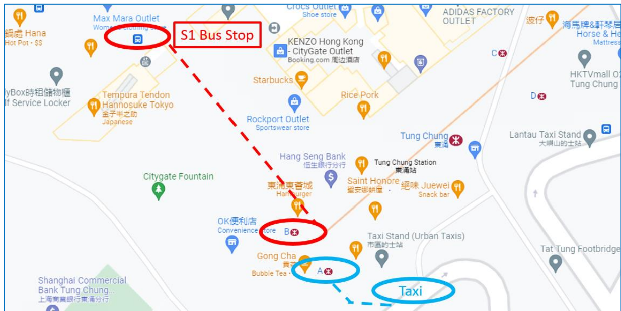
Figure 2 – Public Transport near MTR Tung Chung Station

The following map briefly illustrates the locations of bus terminus for public bus route no. S1 and taxi stand.