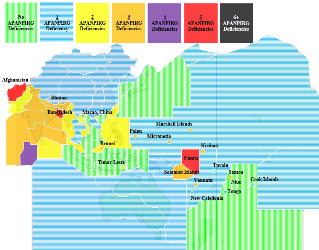
Figure 1: APANPIRG/32 ANS Deficiencies

2.3 Figure 2 provides a graphical indication of the number of APANPIRG Air Navigation Deficiencies currently recorded by APANPIRG for each State.