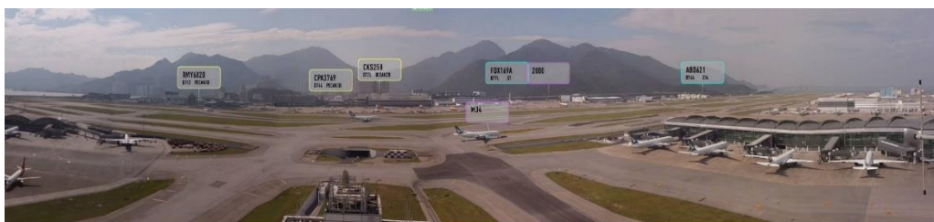
Figure 7 - Panoramic view of runway, taxiway and apron areas with essential flight data tagged on each aircraft

2.2.2 DTF overcomes the physical constraint of traditional air traffic control (ATC) tower and eliminates sight-obstructed apron/taxiway areas/runway ends under all weather and all day-light conditions. Panoramic view of the airfield with real-time situation of aircraft and vehicle movements on the runways and taxiways together with the essential aircraft information is provided to the air traffic control officers to facilitate the provision of ATC services through enhancement of situation awareness.