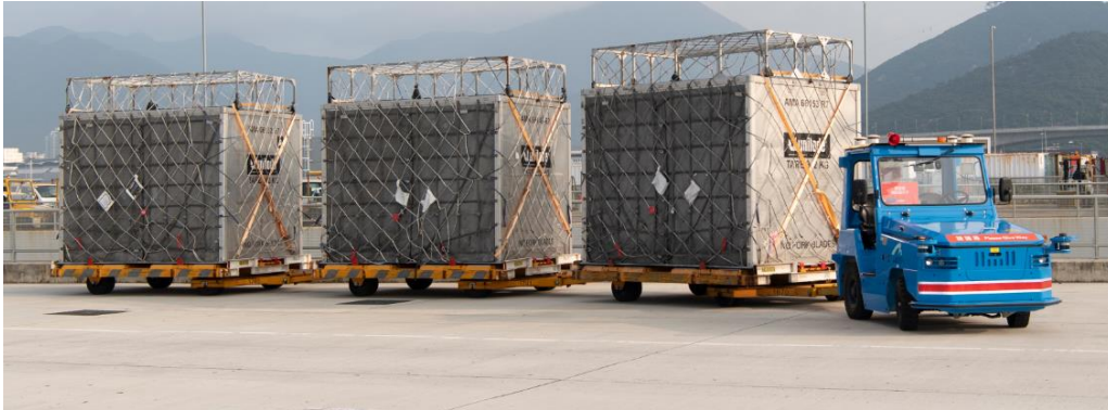
Figure 3 - AET for cargo conveyance

2.1.3 Autonomous Electric Tractor for Cargo deployment (AET Cargo) in February 2022. Similar to the deployment of AET Baggage, the driverless technology has ventured further out to handle cargo conveyance to address the future long distance towing (more than 7km) between cargo handling areas and future apron areas upon the commissioning of 3RS at HKIA. AET Cargo has commenced relevant safety data collection on road portions with different operation features including tunnel, roundabout, lane merging, traffic/obstacle detection and collision avoidance, etc. It is anticipated that the successful deployment of AET Cargo will significantly increase the cost effectiveness of future airport operations.