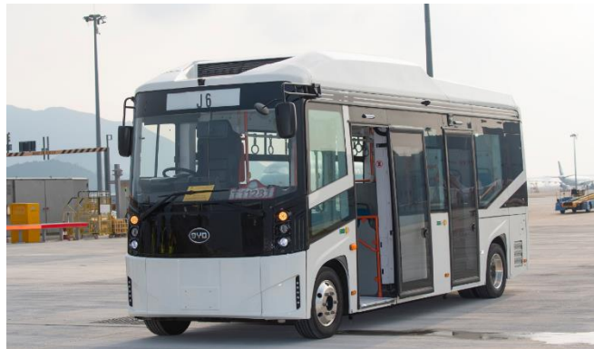
Figure 4 - Preliminary testing of autonomous electric staff bus

2.1.4 Autonomous Electric Staff Bus planned for March 2023. Apron buses are yet another planned application of driverless technology in the AATS. HKIA currently provides the airport community with a staff shuttle service travelling along apron roads. Adopting driverless technology will enable a more convenient service with greater flexibility in operating hours and frequencies.