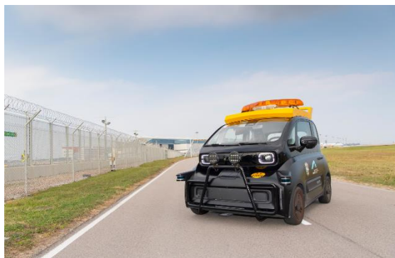
Figure 2 - APC on patrol

2.1.2 Autonomous Patrol Car (APC) deployment in September 2021. Patrol duty along the airport perimeter is usually carried out by airport security officers at regular intervals. As HKIA is in the progress of expansion into a future Three-Runway System (3RS) with a major increase of operation footprint, similar driverless technology has been deployed to enhance the efficiency and effectiveness in perimeter patrolling. The deployment has been adopted with relevant aviation security surveillance functions with increased patrolling frequency thus reduced pressure on airport security officers' rostering in particular during adverse weather.