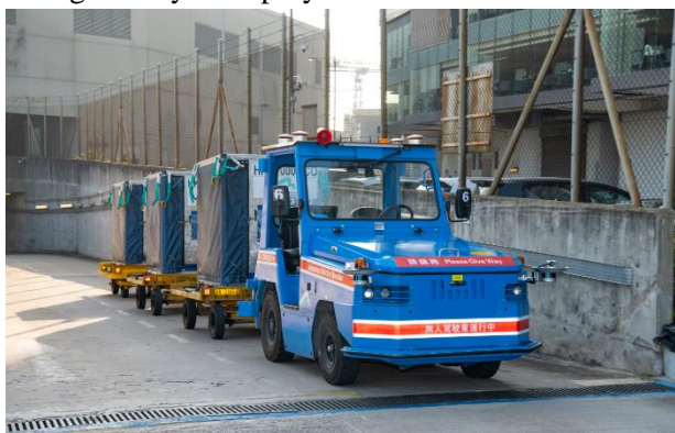
Figure 1 - AET departing from Baggage Hall at SkyPier

2.1.1 Autonomous Electric Tractor for Baggage deployment (AET Baggage) in December 2019. Baggage of passengers using the ferry transfer services to/from the Mainland China and Macao are currently being transported through a 2km airside road between the Baggage Hall at Terminal 1 and the SkyPier. Tractor drivers and airport security staff originally assigned to such baggage transfer tasks can be gainfully re-deployed to other duties.