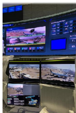
Figure 5 - DAMS workstation

2.2 Digital Apron and Tower Management Systems (DATMS). To prepare HKIA in moving forward under the Smart Airport vision, digital transformation roadmap encompasses a wide scope of digitized activities and comprehensive business strategy. Multi-facet operations including airport operations, capacity management and stakeholder management can now leverage a diverse spectrum of mature technologies and innovations to enable increased operational integration in airport community. Against such background, DATMS is a project being developed jointly by CAD and AA with an aim to enhance the aerodrome safety and operational efficiency at airfield, apron and tower. DATMS comprise of two systems, namely (1) Digital Apron Management System (DAMS) and (2) Digital Tower Facilities (DTF).