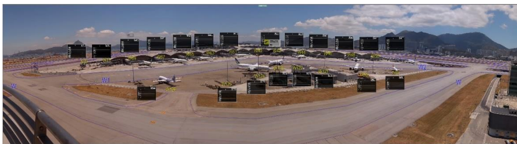
Figure 6 - Panoramic view of apron areas on video wall panels of DAMS installed at IAC, HKIA

2.2.1 To support airport transformation and 3RS at HKIA, DAMS serves to provide aerodrome surveillance and anomaly detection functionalities. The solution will provide personnel in the new Integrated Airport Centre (IAC) not just with new infrastructure but with new automated digital experience of surveillance on apron area and critical aircraft maneuvering areas for situation assessment and operations planning.