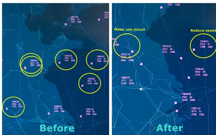
Figure 3: The effect of accuracy adjustment at AND

1.7 In October 2020, Shanghai ATCC decided to make an XMAN operation trial at AND. Shanghai ATFM organize this test by ATFM system. Shanghai TMA set the FMP to monitor the inbound traffic flow overfly time list. In case of the separation is not enough, Shanghai TMA FMP will inform Shanghai ACC FMP to modify the overfly time for defined flight(s). The maneuvering instruction (Figure 3) or RTA modification (Figure 4) will be issued by ACC controller. The maximum coordination distance is enlarge to 325 miles in Shanghai FIR. By this way, the holding in the Shanghai TMA is decrease and the ATFM measure is reduced to 10 minutes for each direction.