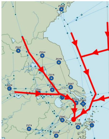
Figure 2: The convergence traffic flow at AND (red dot)

1.6 In Shanghai TMA, the traffic flow via AND to ZSHC, ZSNB and ZSZS will converge from 5 directions. The arrival traffic flow to ZSSS and ZSPD is also coming from the south of AND. So, the transfer flight level at AND is limited for these 4 directions. Therefore, Shanghai TMA usually issue 30 minutes separation for these 4 directions (Japan and ROK is exempted). In real operation, the extra holding still cannot be avoided in Shanghai TMA, because the MINIT cannot manage the overfly time at AND.