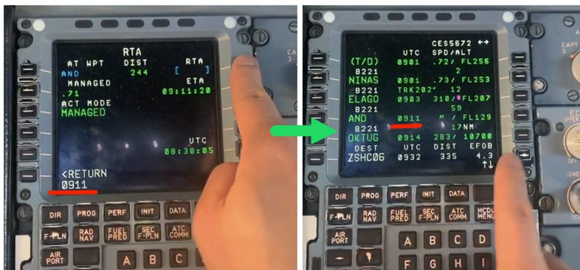
Figure 4: The pilot input the RTA (Required Time Arrival) which issued by ACC controller.

1.8 By this XMAN test, we found that the estimated overfly time calculated by radar will have an error of 2-3 minutes sometimes. To get the accuracy overfly time, we plan to improve it through the VHF data link. One TBO evaluation project was held in 2021 by CAAC, Shanghai ATCC and ADCC jointly execute this project by XMAN operation. We upgrade the ATFM system to send the ETO request to ADCC, ADCC will send a check message to the cockpit by VHF data link. Then the reply from the cockpit will be sent in few seconds, this data will update the ETO in Shanghai ATFM system. The FPM in Shanghai TMA and ACC can make more accuracy modification than before. Experimental data shows that the error of one hour flight trip will be controlled within 30 seconds. The real test will be implemented in Q4 2021.