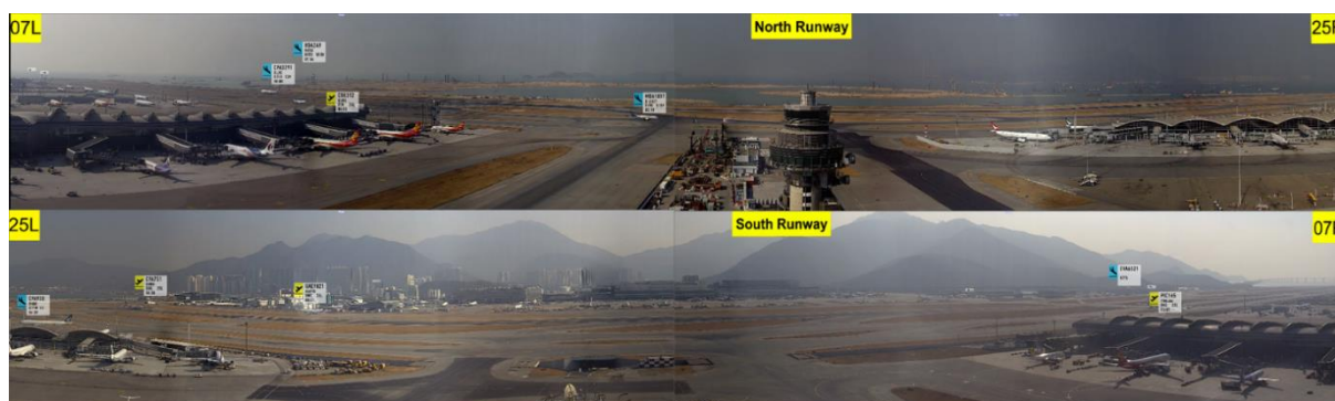
Figure 1. Mock-up panoramic view of North Runway (07L/25R) and South Runway (07R/25L) on video wall panels of DAMS installed at IAC, HKIA.

2.3 To support airport transformation and large-scale expansion plans at HKIA, DAMS serves to provide aerodrome surveillance and anomaly detection functionalities. The solution will provide personnel in the new Integrated Airport Centre (IAC) with brand new automated digital experience and increase their situational awareness on both apron(s) and critical aircraft manoeuvring area(s), and hence facilitate safety assessment and operational planning.