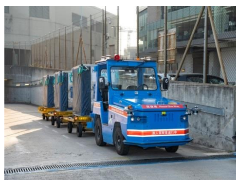
Figure 2 AET departing from the Baggage Hall at SkyPier

2.5 Throughout the process of AET development, AA had maintained close collaboration with regulatory authorities and stakeholders to resolve concerns including aerodrome safety, aviation security