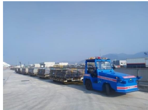
Figure 3 Preliminary testing on AET for cargo conveyance

2.7 With over 50% increase of operation footprint at HKIA upon the commencement of the 3RS in 2024, the maximum cargo towing distance between parking stands and cargo terminals is expected to be doubled. Building from the success of AETs application on baggage conveyance, AA had commenced feasibility studies and ramp community engagement on deploying AETs for cargo conveyance between cargo terminals and the newly developed 3RS apron.